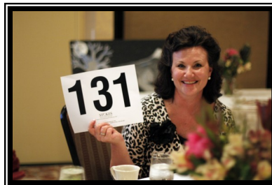
Bidding during our live auction.

One of the highlights of the auction was the premier of our Visible Grace video , which was made and donated by Great Fish Media . If you haven't seen it yet, or would like to watch it again, please check out our website– www.visiblegrace.org – and click on the link in the right hand column (about halfway down). We are very excited about this video and encourage you to share it with your friends! We are also working to make it available on DVD so you can share it with your friends.