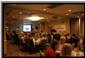
Dinner in the grand ballroom at the Crowne Plaza Hotel.

To see more of our auction pictures, please visit our facebook page: www.causes.com/causes/105908