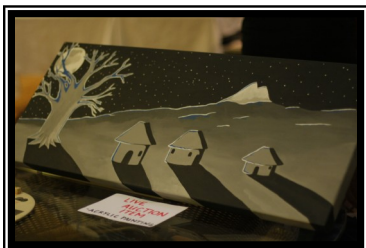
One of the custom made pieces of artwork donated to our auction.